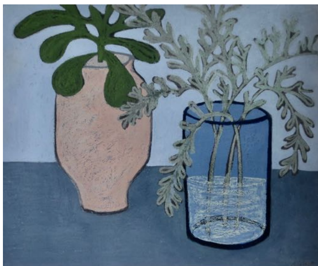
Cool Thursday, 2019

Soft pastel on paper 33.5" x 38" framed 28.5" x 33.5" unframed $5,300