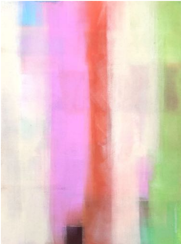
Vibe , 2016

Acrylic on wood panel 24" x 18" x 2" $1,900