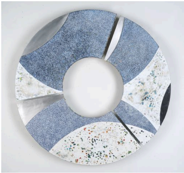
Convex #29, 2018

Acrylic and wax on aluminum 29" diameter $5,000