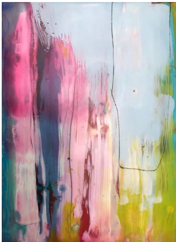
Navigating 20, 2019