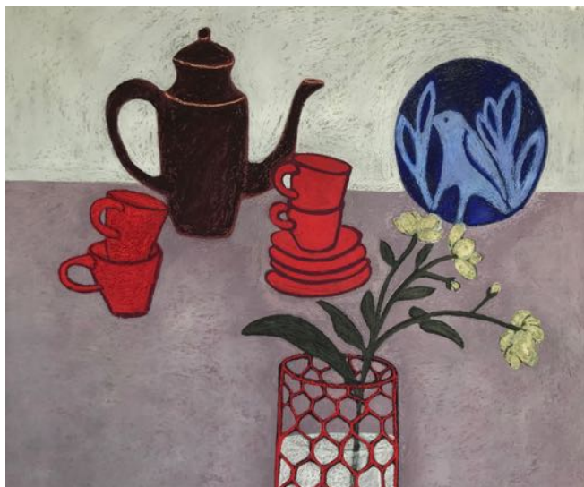
Bird Plate, 2019

Soft pastel on paper 33.5" x 38" framed 28.5" x 33.5" unframed $5,300