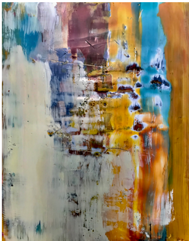
Navigating 25, 2019