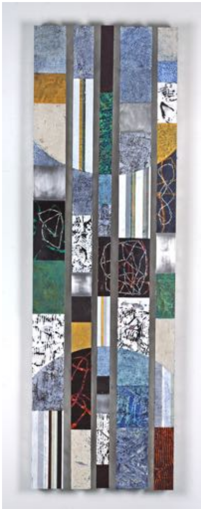
Strata I 9 Set B, 2019

Acrylic and wax on aluminum 29" diameter $5,000