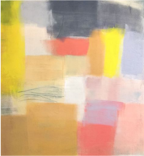
Mid Century I , 2016