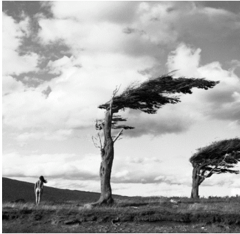
Ushuaia , 2003 Silver gelatin print 18 x 18 inches