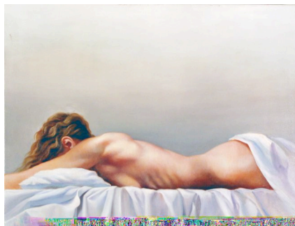
White Room , 2006 oil on linen 20 x 26 inches