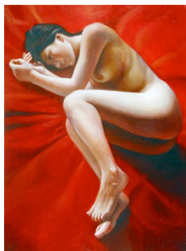
Red Velvet , 2006 oil on linen 24 x 18 inches