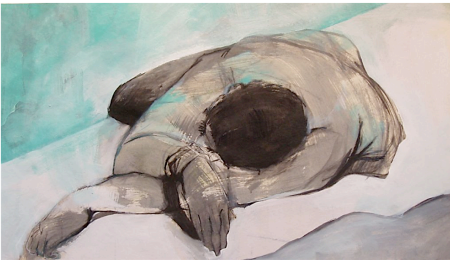
Resting in Blue, 2006 Acrylic and charcoal on wallpaper 22 x 38 inches