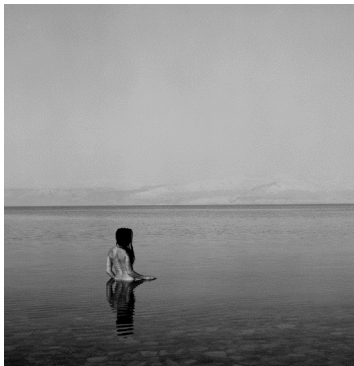
Water Sifter , 2003 Silver gelatin print 18 x 18 inches