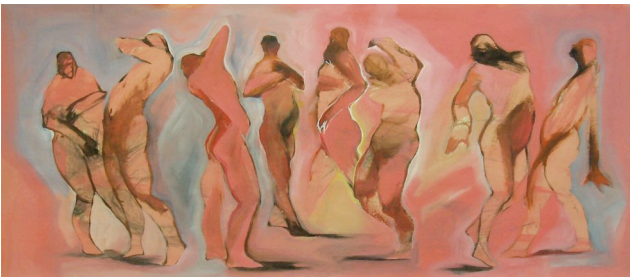
Fiesta, 2006 Acrylic and charcoal on wallpaper 25 x 56 1/2 inches