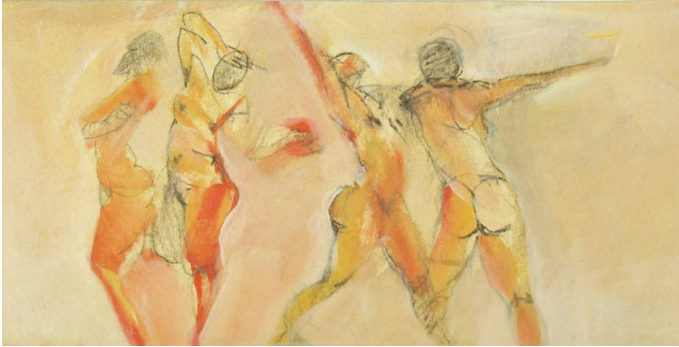
En Movimiento, 2005 Acrylic and charcoal on wallpaper 6 ¼ x 13 inches